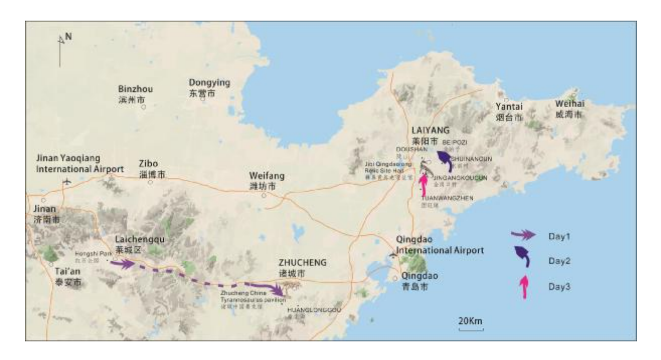
Figure 3. Pre-symposium field excursion plan and visiting localities

Wednesday, October 16, 2019 – Scientific sessions, business meeting. Thursday, October 17, 2019 – Departure of participants.